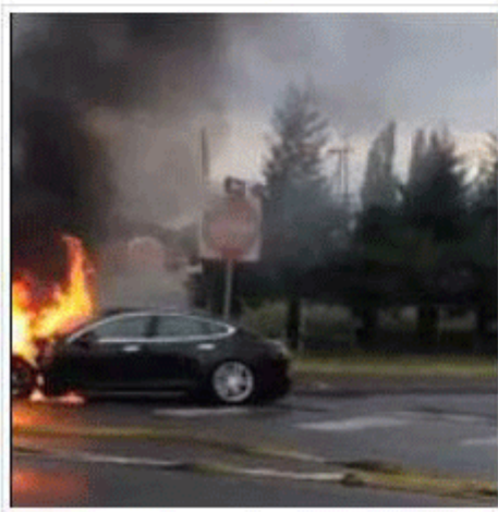
TESLA BATTERIES EXPLODE INTO FLAMES ON PUBLIC ROAD

Another Tesla crash destroys another Tesla as well as Obama campaign financier: Jeffrey Katzenberg; who quickly tries to cover up fact that he funded Tesla kick-back scheme