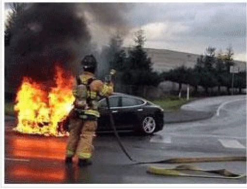
TESLA BATTERIES EXPLODE INTO FLAMES ON PUBLIC ROAD