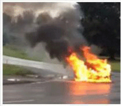
TESLA BATTERIES EXPLODE INTO FLAMES ON PUBLIC ROAD